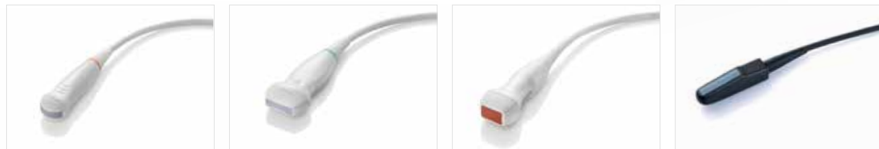
C11-3s, micro-convex array Small animal's abdomen, cardiac