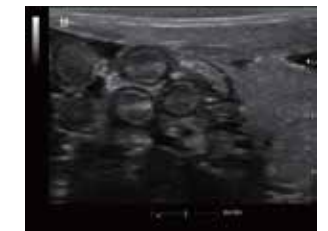
Turtle-Ovary & Spawn