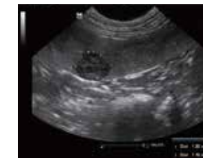
Canine Spleen Mass